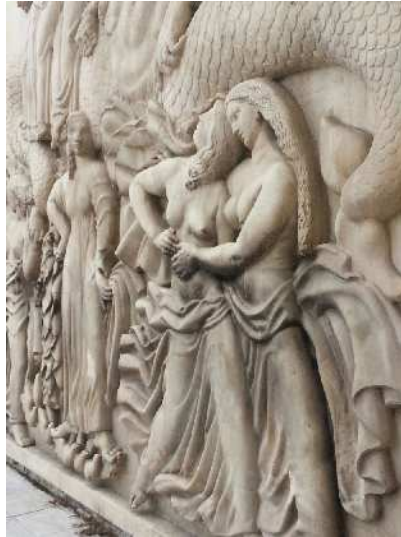
Two female characters engaged in saphimism under the aegis of a fish-tailed Abgal creature.

Enki's gift of sexed reproduction made to Men, Enki being originally asexual as well, is the reason why society and especially the Bible, have turned sexuality into a complete taboo; genetic alterations through sexual relations with some non-human entities requiring to remain hidden from human understanding and science. Biblical narratives produced to deliberately distort this reality have inspired the image of a temptress and sinful "Eve", created long after the male human being, as a kind of by-product next to him. In this way, religions have tried to hide the result of this genetic manipulation in legends and liturgical accounts.