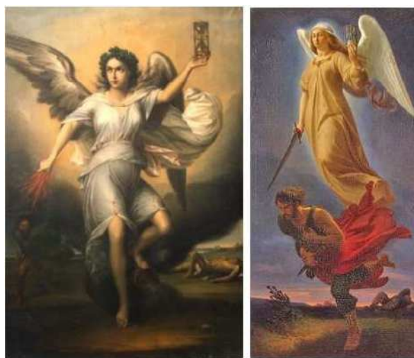
When the times have passed, Nemesis punishes men pretending to be the creator.

Nemesis is therefore that goddess who relentlessly punishes men who take themselves for "the creator" and who commit acts beyond the prerogatives of a mere mortal. Hubris leads to the goddess, the higher spirit of heavenly punishment. Nemesis then becomes the fateful agent of the fall of these manipulators of the human mind.