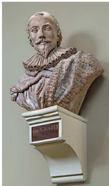
Guillaume de Nogaret's bust

https://www.wikizero.com/fr//Guillaume_de_Nogaret